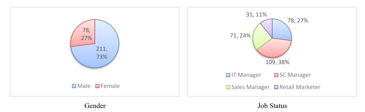
Fig. 2. Personal characteristics of the participants (n = 289)

In the survey analysis, the research findings revealed a high number of male participants compared to females and a high range of supply chain managers 109. Fig. 2 illustrates the demographic data summary.