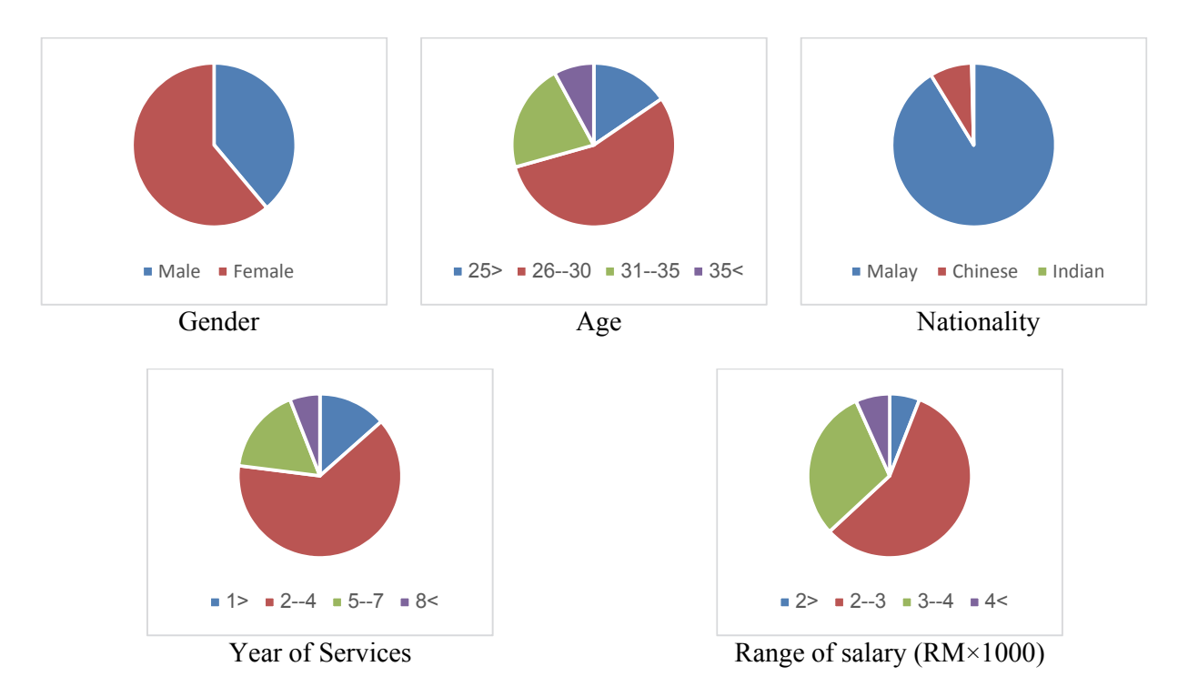
Fig. 1. Personal characteristics of the participants

Fig. 2 shows the summary of the respondent's profile among high potential employees in selected manufacturing organization in Malaysia. The results indicate that the majority of respondents were female with 61.0 percent. Meanwhile, the study shows most of the respondents were between range age of 26 until 30 years old with a percentage of 55.2 percent. Additionally, Malay participated dominantly and most of the respondents had a range of services between two to four years by 63.5 percent.