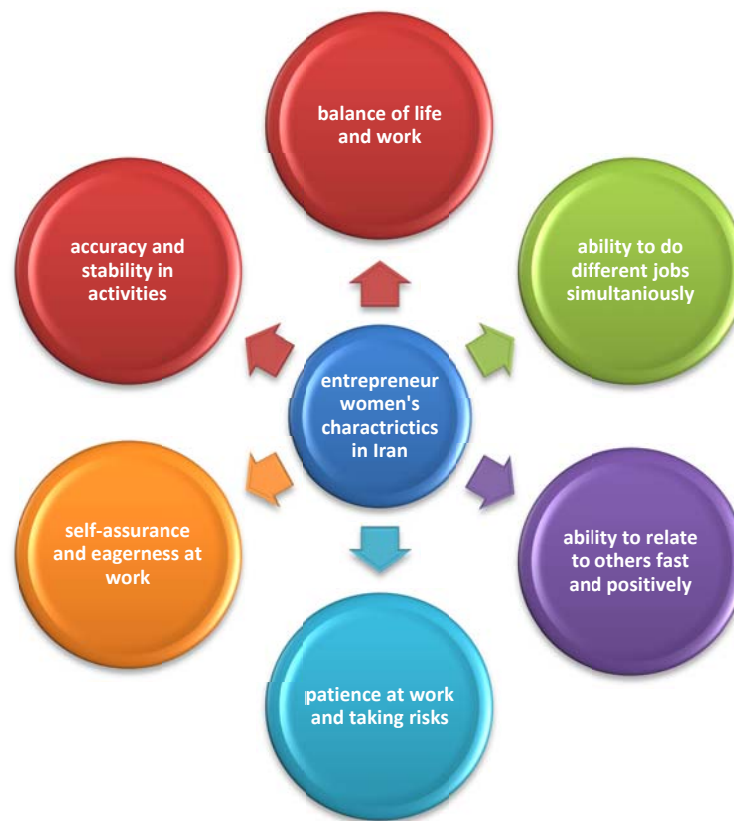
Fig. 1. Research conceptual model

In addition, the following conceptual model shows six superior characteristics of entrepreneur women that can be considered for other women who would like to be entrepreneur.