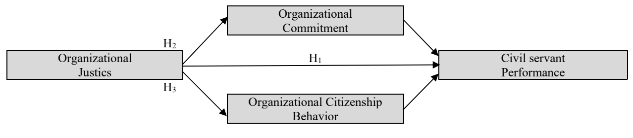
Fig. 1. Research Conceptual Model

The conceptual model to be tested is presented in the following Fig. 1.