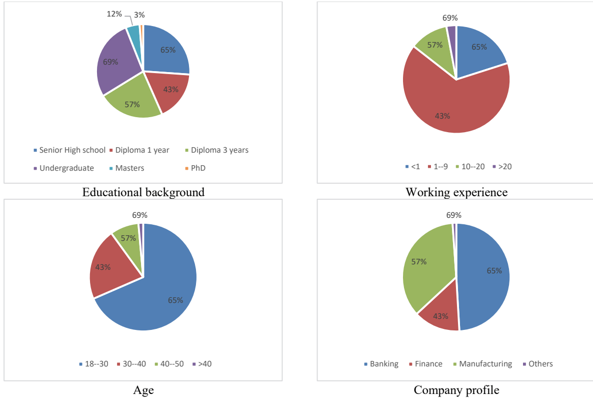
Fig. 2. Demographic data of the respondents

Fig. 2 depicts the majority of the respondent educational background was undergraduate (193 respondents, 69 percent), had worked experience from 1 until 9 years (87 respondents, 62.6 percent), was working in a various field outside Banking, Financial institutions, manufacturing (110 respondents, 79.1 percent), and had to age between 18 until 30 years old (95 respondents, 68.3 percent).