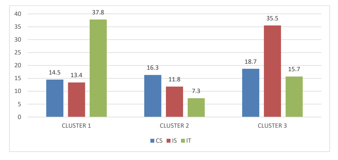
Fig. 1. Computing Department Tracks Among the Three Clusters

Cluster 1 has the highest score for: "Student Academic Level Follow Up" and "Students Relations with their Academic Advisors". Hence, students in this cluster have a good relationship with their academic advisors. Students in this cluster have a positive attitude towards the care provided from their advisors as they are interested in their academic level and as they try to follow up with them by understanding their academic situations and helping them effectively. This group mainly represents second-year students (75.6%). Most of the students in this group are enrolled in the computing department (79.7%). In cluster 1, most of the students (90.1%) have non-Arabic academic advisors.