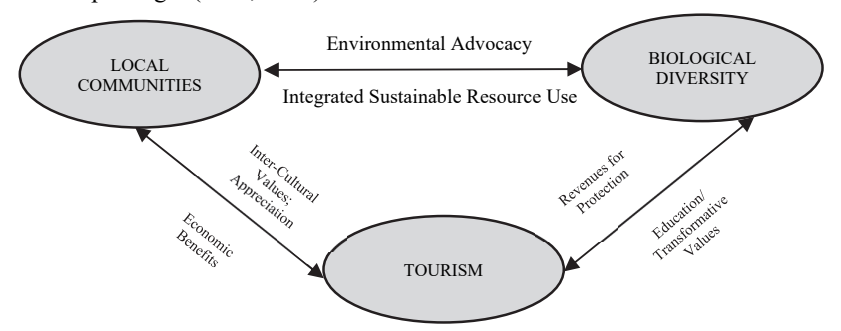
Fig. 1. Successful Ecotourism Paradigm (Ross & Wall, 1999)

Ecotourism is seen as a means of protecting the natural environment through income generation, ethics education or environmental preservation and involvement of local communities (Ross & Wall, 1999). At the same time, conservation and development will be carried out in the context of sustainability. Thus, the dimensions of ecotourism development are protection of the natural environment, conservation, economic development, income, education and involvement of local communities. The ecotourism paradigm (Wall, 1996) is described as follows: