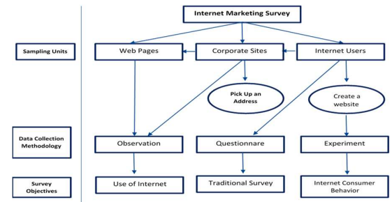
Fig. 2. Typology of Internet Marketing Research