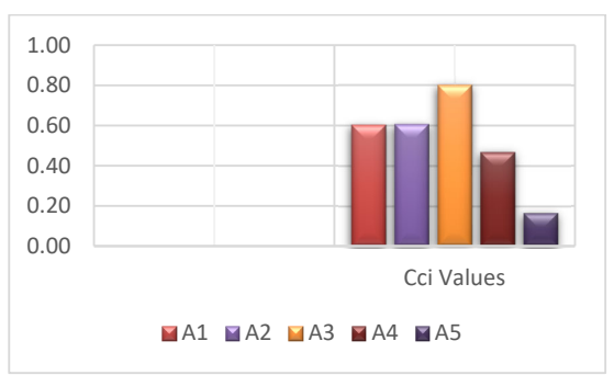
Fig. 2. Closeness coefficient graph

The fuzzy TOPSIS result determined that recycling of municipal solid waste is the best alternative in Dire Dawa City, followed by reuse. Depend on results, the MSWM alternatives in Dire Dawa city are as follows: Recycling (A3) > Reuse (A2) > Reduce (A1) > Energy recovery (A4) > Disposal (A5).