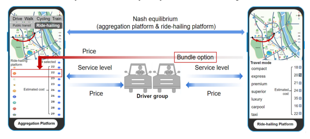
Fig. 1. Structure of the bundle mode

The order sales system consists of a ride-hailing platform, an aggregation platform, and a driver group. Price and service level are core factors interacting among those three stakeholders. There are two Stackelberg games where the driver group serves each platform respectively on the service levels and each platform as a leader dictates the order prices for the driver group. The two platforms aim at a Nash equilibrium to obtain optimal prices, as illustrated in Fig. 1.