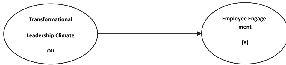
Fig.1. Research Framework