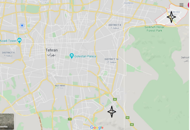
Fig. 5. The optimal location and its second alternative for establishing the hub in the eastern part of Tehran

Fig. 5 displays both alternate locations for the hub on a single map.