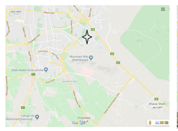
Fig. 4. The second optimal location for establishing hub logistics in the eastern part of Tehran

While the optimization model designates the star location as the optimal hub site, concerns arise regarding the restriction on truck traffic. In accordance with the regulations in Tehran, the main highways on star location permits trucks weighing more than 6.2 tonnes to operate only between the hours of 10:00 p.m. and 6:00 a.m. Consequently, this limitation not only hampers the efficiency of hub capacity utilization but also leads to shipment delays. To address this issue, we identify an alternative location by excluding the star location from the list of candidate sites. By solving the mathematical model, we determine the following optimal location, which is depicted in Fig. 4.