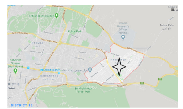
Fig. 3. The optimal location for establishing hub logistics in the eastern part of Tehran

Considering the economic situation within a range of 0 to 1, a higher index value indicates a more favorable economic condition in the respective area. For instance, if a region has a population of 1000 and an economic index of 0.1, it implies that the potential demand for that region is estimated to be 100. To determine the most suitable resilient locations for our case study, we implemented the two-phase methodology outlined in section 3. In the first phase, we assessed and ranked the candidate locations based on their resilience criteria using the SWARA-EDAS method. Subsequently, we utilized CPLEX 12.6 to solve the proposed model and identify the optimal hub location. The optimal hub location is denoted by a star symbol in Fig. 3.